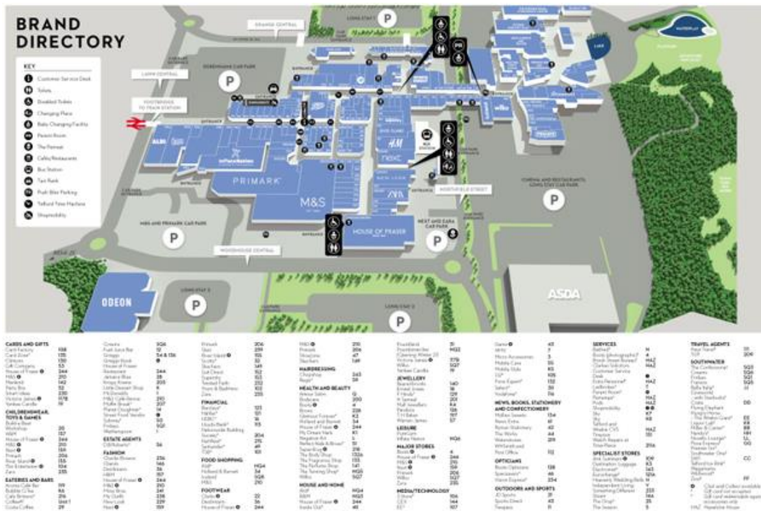
(Centre Map | Telford Centre - Home , 2022)

The International Centre is a 5-minute walk from the Telford Shopping Centre and Southwater Entertainment Quarter with IMAX Cinema, ice rink and ten pin bowling. Nearby is the wonderful Telford Town Park which offers acres of woodland walks and free fun in the many play areas, alongside high ropes, zip wire and mini golf activities.